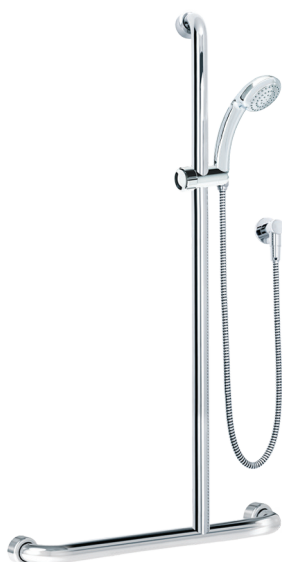
Drawn RH (Right Hand)